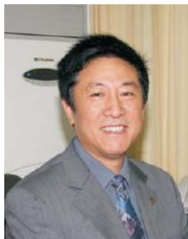
Yipan Nanjing Univ.